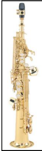
London Soprano Saxophone Straight TGS 346L